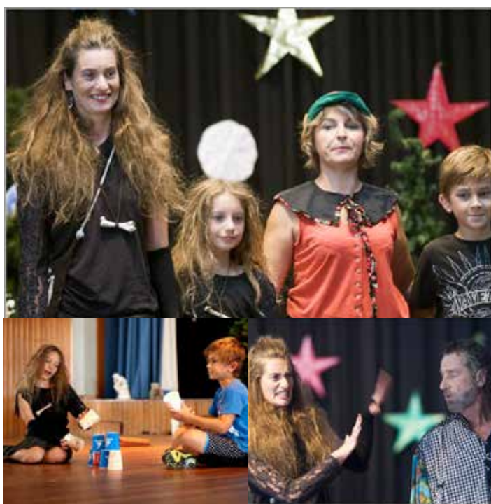
Scenes from The Enchanted Forest